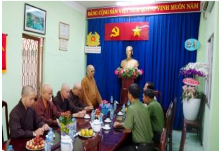
Leaders of the Buddhist Sangha of Vietnam in Ho Chi Minh City visited the Police Department of Social Order (PA88) on July 12, 2016 on the occasion of Traditional Day of Vietnam Public Security Force