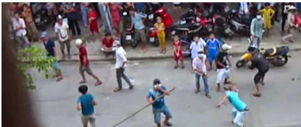
The image was taken from a video clip on Dan Lam Bao website, posted on April 11, 2014